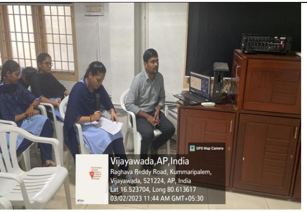
Students participating in seminar